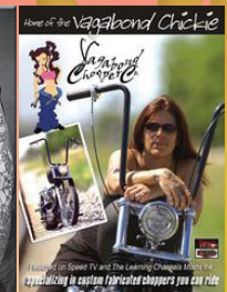
Host of the Vagabond Chickie

Movie & TV Star of "Monster," "Bad Boys," "Walker, Texas Ranger," "Running Cool" & more.